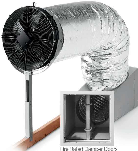
Fire Rated Damper Doors